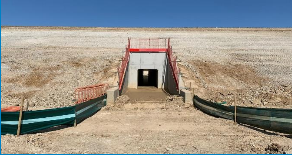
River Ash culvert south outlet

The River Ash culvert and Cradle End Brook culvert were all completed too.