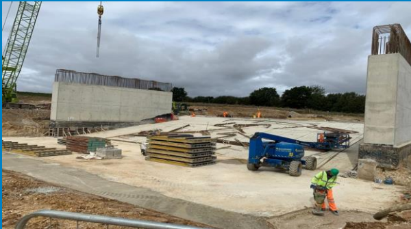
Progress on the River Ash spillway