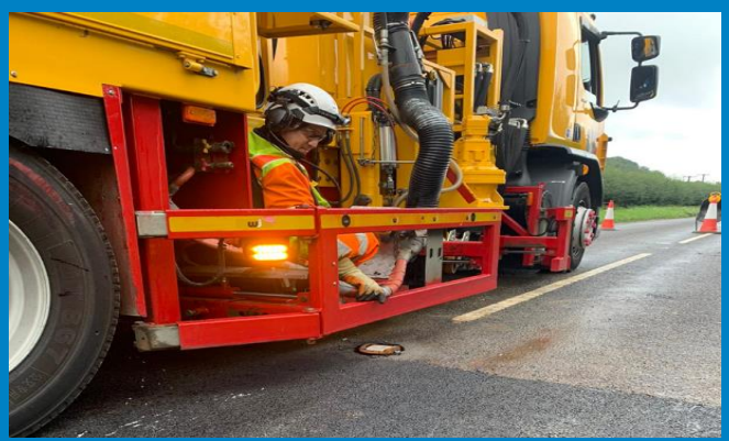
Installation of the road studs at The Ford