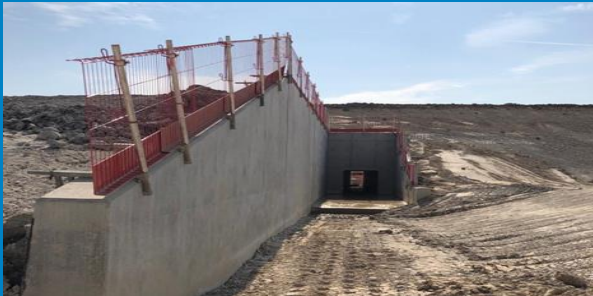
River Ash culvert under the new road