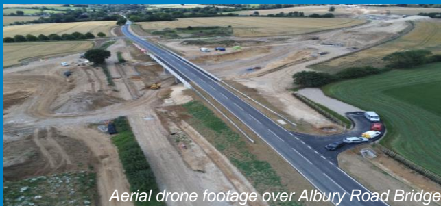
Aerial drone footage over Albury Road Bridge

The scheme will improve air quality in Little Hadham and also ultimately benefit the county's economy, with quicker transport links to Stansted Airport alongside other long-term advantages for Hertfordshire. Hertfordshire County Council have worked in partnership with the Environment Agency to develop the scheme to include flood alleviation measures.