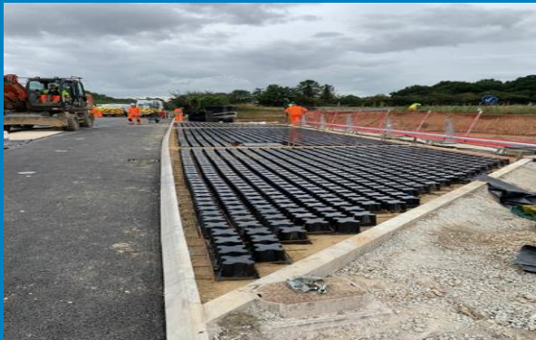
Above and below image: Grasscrete installation at Lloyd Taylor Drain

Grasscrete is also being installed at Lloyd Taylor Drain. Shown below, this is a reinforced concrete structure with lots of small pockets for grass to grow through, helping to blend into the environment. It is generally used for access for maintenance vehicles.