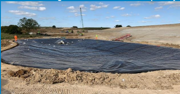
Lining laid at the River Ash drainage pond