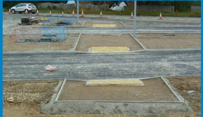
New crossing installed at Tilekiln Roundabout